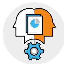
Expert Team of Security Analysts & Responders