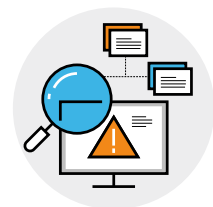
Defined Investigations & Response Playbooks