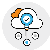
Threat Intelligence & Automation Platform

Aspire MDR combines an expert team of security analysts and incident responders with industry-leading threat intelligence, an automation and security incident & event management (SIEM) platform, and defined response playbooks. The service leverages a multi-layered security architecture to advance defense capabilities by delivering 24/7 threat monitoring, detection, and response. Delivered from Aspire's Network & Security Operations Center (NSOC), our team exposes potential adversaries by prioritizing threat activity to identify which events require action. Built-in automation, threat intelligence, and customized playbooks reduce the mean time to detect and contain threats with relevant, meaningful and prioritized response actions.